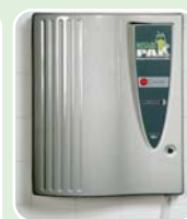
Silver Module, model ref: GP-DMi/STD-SS (battery) or GP-DMi/Mains-SS