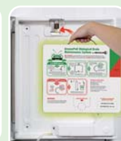
Fluid sold separately, model ref: GP-MSGD5