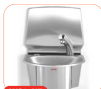
WS6-NT with Delabie Tempomatic 3