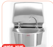
WS6-KVS 'push-front' with spout