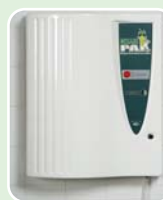
White Module, model ref: GP-DMi/STD (battery) or GP-DMi/Mains

Dosing modules available in two colours: white or silver and available as battery-operated or mains-operated units