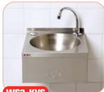
WS3-KVS 'push-front' with spout

Optional soap dispensers & splashbacks available, for most models. Call us for details or visit www.mechline.com